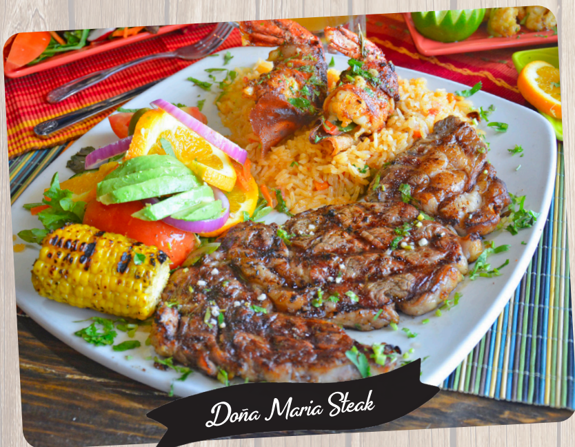
Doña Maria Steak

Giant Molcajete bowl with authentic Mexican Ranchera sauce, chargrilled steak, chicken, chorizo, pork ribs, shrimp, cactus, fresh cheese sticks, chiles toreados, and cambray onions. Served with rice, beans and guacamole salad. 52.49