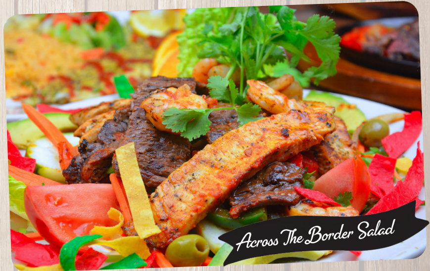
Across The Border Salad