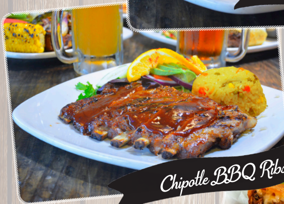
Chipotle BBQ Ribs

Four rolled corn tortillas stuffed with shredded chicken and lightly fried. Topped with green sauce, lettuce, avocado slices, sour cream, onions and queso fresco. Served with rice and cheese dip 16.99