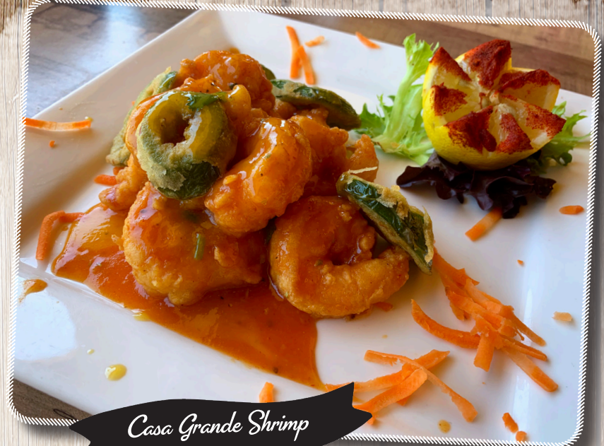
Casa Grande Shrimp