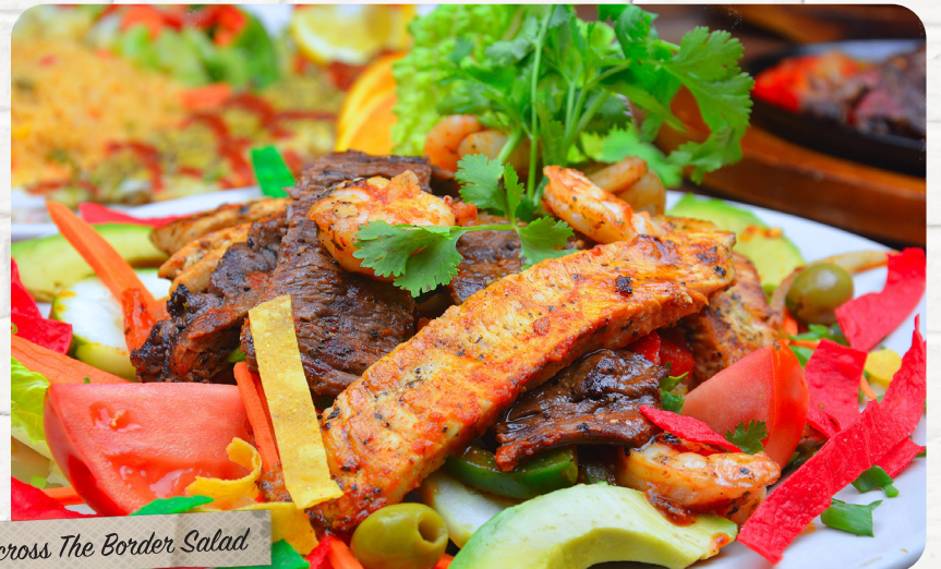
Across The Border Salad