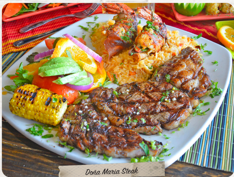
Doña Maria Steak

Rib-eye steak topped with ranchera sauce and served with rice, corn on the cob, beans and tortillas 19.99