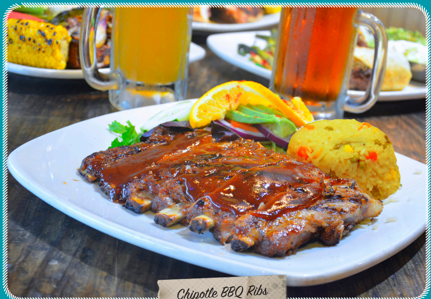
Chipotle BBQ Ribs